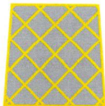
Box junction - See Rule 174