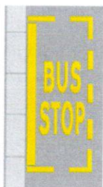
See Rule 243