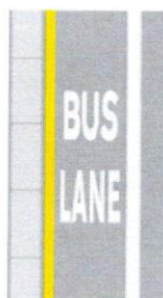
See Rule 141